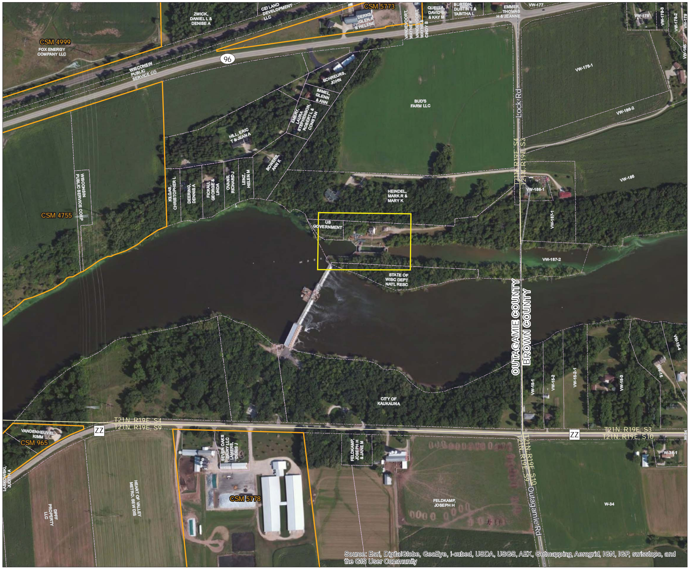
Figure No. 4 Title Plat & Parcel Data

Client/Project Fox River Navigational System Authority Rapide Croche Boat Transfer and Aquatic Invasive Species Cleansing Station