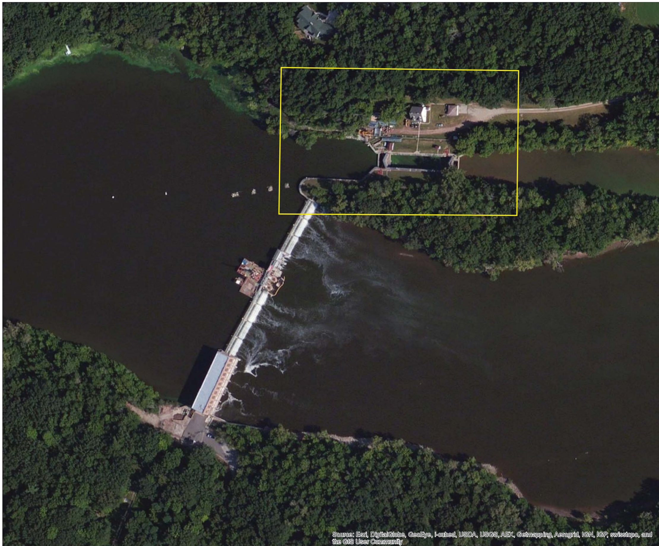
Figure No. 2 Title Project Location & Orthophotography

Client/Project Fox River Navigational System Authority Rapide Croche Boat Transfer and Aquatic Invasive Species Cleansing Station